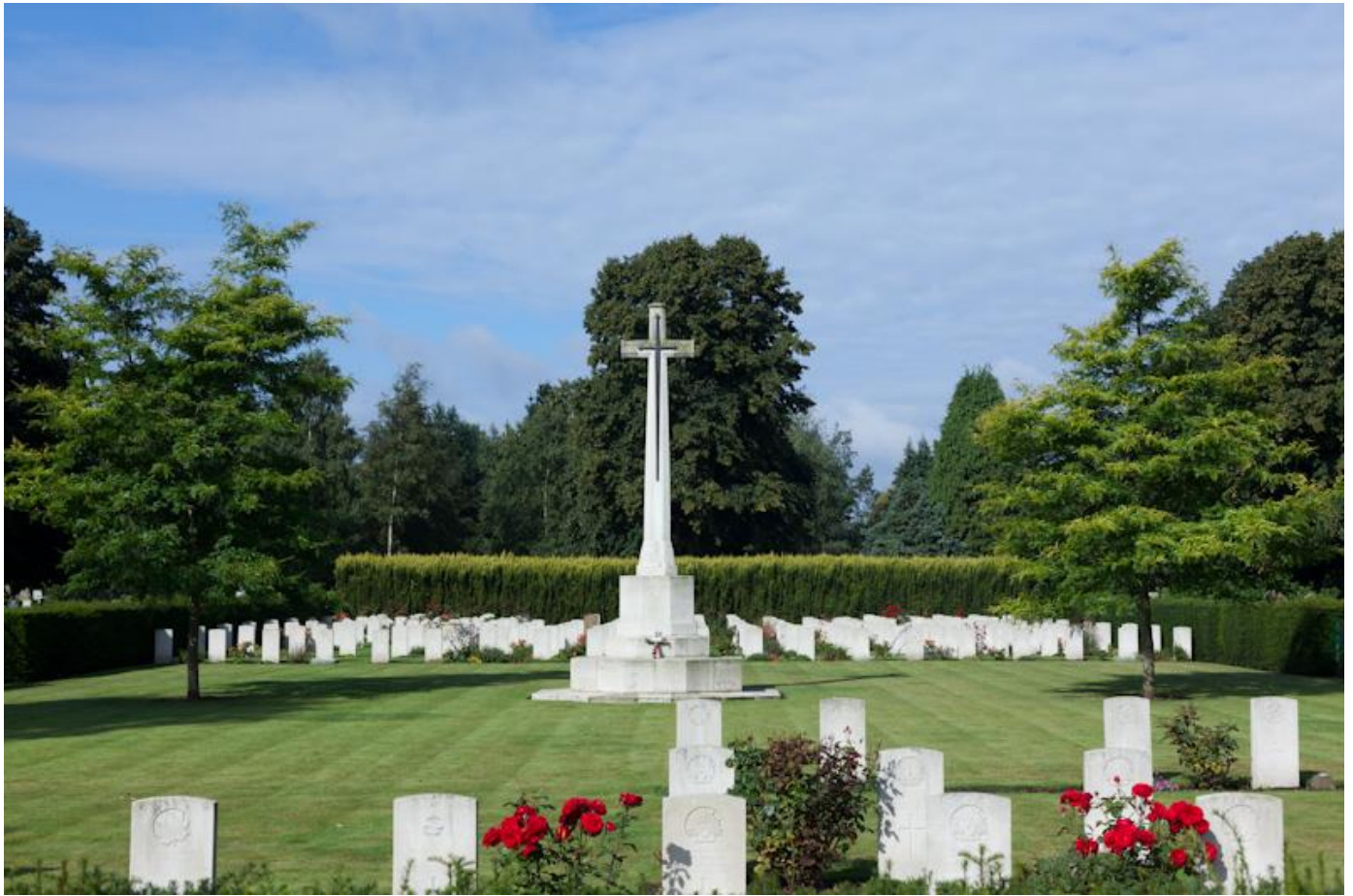
Earlam Road Cemetery, Norwich