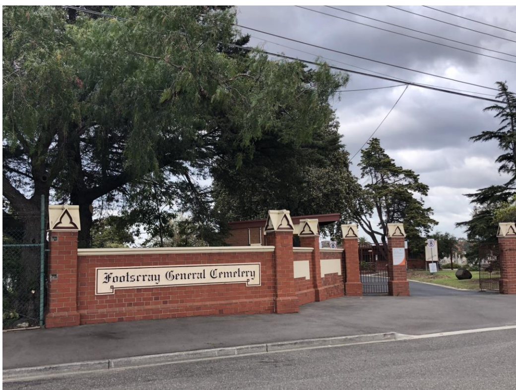
Footscray General Cemetery